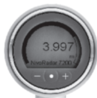
NR 7200 Plug on Display With push buttons