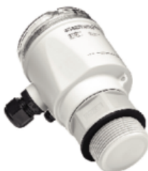
NR 7200 with Display (transparent lid)