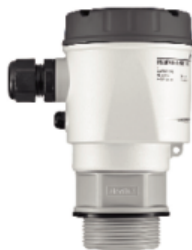
NR 7100 and NR 7200 without Display (non transparent lid)