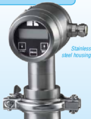
Stainless steel housing

HART® is a registered trademark of the HART Communication Foundation