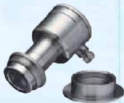
8000-SAN with sanitary weld-on nipple diam. 85 mm

All versions enjoy ATEX approval for Intrinsic Safe applications.