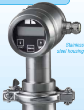
Stainless steel housing

HART® is a registered trademark of the HART Communication Foundation